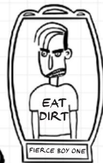
FIERCE BOY ONE