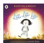
La La La Kate DiCamillo 9781406379884 PB Classroom ideas available