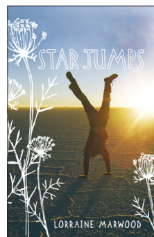
Star Jumps by Lorraine Marwood

ISBN: 9781921150395 Arrp: $14.95 NZrrp: $16.99 Ext: 128pp Published July 2008 Teachers' Resources Available